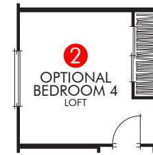
Optional Bedroom 4